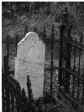
Idaho City Pioneer Cemetery!