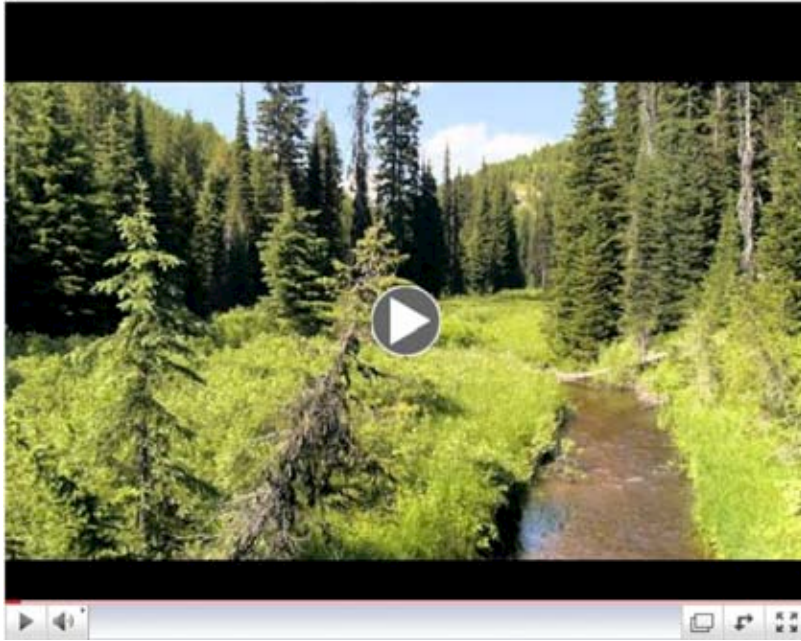
Glade Creek Campsite

Watch videos of Historic Preservation Projects around the state on the Trust's new Video Blog Site: http://idahoheritage.org/blog/ .